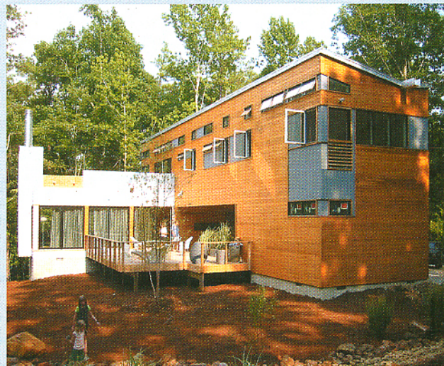
● This Dwell Home was designed by Resolution: 4 Architecture.

Resolution: 4 Architecture (Re4a.com), in New York City, designs panelized and other types of homes. Its Dwell Home,